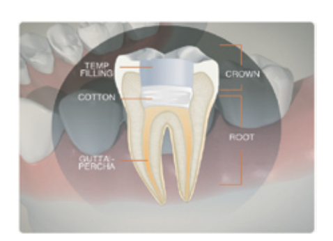
1. GUTTA-PERCHA REPLACES THE PULP TO KEEP TOOTH STRONG.

Your dentist or hygienist, will be able to answer any other questions you have about this procedure.