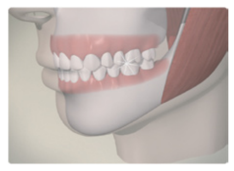
6. FINAL CROWN IS CEMENTED IN PLACE.