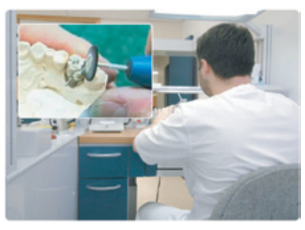
5. CROWN IS CUSTOM MADE AT THE DENTAL LAB.