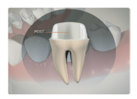
4. TOOTH IS PREPARED FOR THE CROWN.