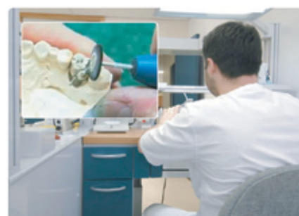
5. CROWN IS CUSTOM MADE AT THE DENTAL LAB.