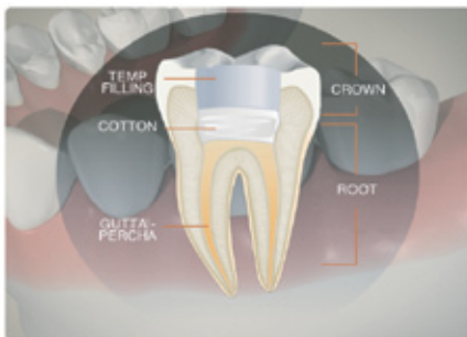
1. GUTTA-PERCHA REPLACES THE PULP TO KEEP TOOTH STRONG.

Your dentist or hygienist, will be able to answer any other questions you have about this procedure.