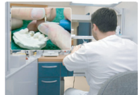
3. POST IS CUSTOM MADE AT THE DENTAL LAB.