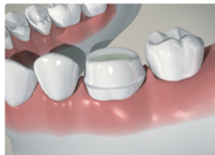
2. THE TOOTH IS PREPARED FOR THE POST.