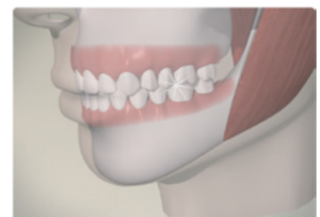
6. FINAL CROWN IS CEMENTED IN PLACE.