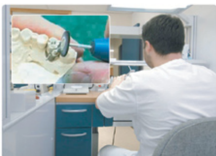
4. THE CROWN IS CUSTOM MADE AT THE DENTAL LAB.