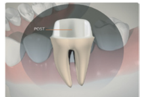
3. THE TOOTH IS PREPARED FOR THE CROWN.