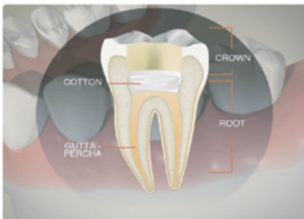
1. GUTTA-PERCHA REPLACES THE PULP TO KEEP TOOTH STRONG.

Your dentist or hygienist, will be able to answer any other questions you have about this procedure.